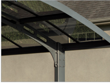
Heavy duty - aluminum structure