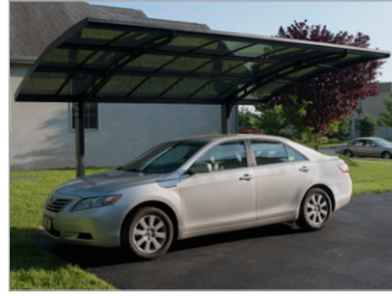
Sturdy & durable design